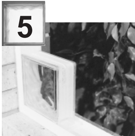
Place the first row of glass blocks in the frame sill, supporting and spacing each block with a "T" connector.