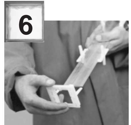
Snap the required amount of "X" connectors onto the stiffener bar and one "T" connector on each end.