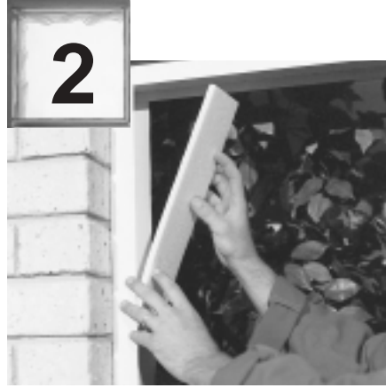
Place the Ezylay expansion material in both verticals of the Ezylay frame ensuring it extends from top to bottom.