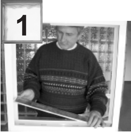
Place sill infill in bottom of frame.