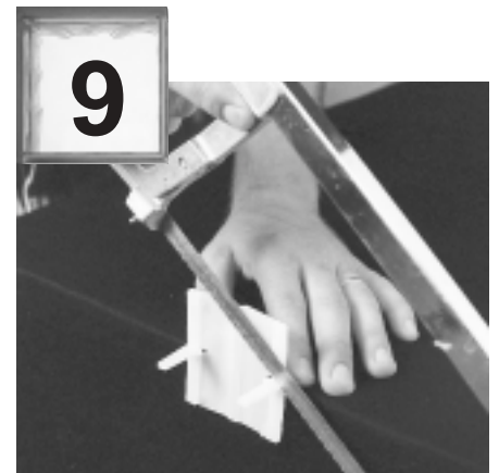
Cut the top off both legs by 20mm of two "X" connectors (as illustrated) for the vertical joints closest to the last block to be inserted.