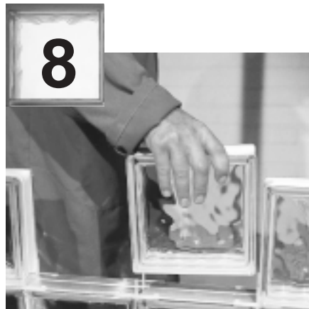
Place the next row of glass blocks and then repeat steps 5, 6 and 7 until one stiffener bar and one row of blocks remains to be installed.