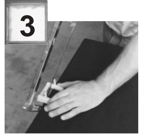
Cut the two "T" connectors where indicated as per diagram.