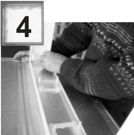
Place a cut "T" connector in the bottom corners of the frame on top of the sill infill, with the open end against the expansion material.